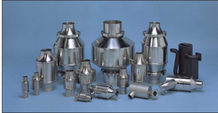
AZ Diesel Oxidation Catalyst